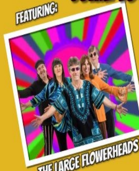
THE LARGE FLOWERHEADS