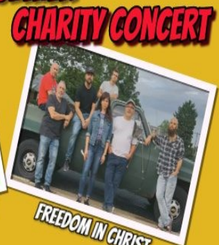
FREEDOM IN CHRIST